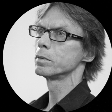
Douglas Wright CHOREOGRAPHER

“In moving the body IS, the mind IS - our whole being participates to make something that wasn't there before, and this is something larger than us. This “something” is what we're dancing with, for and in; holding our death in our bodies like a sleeping child - careful as we move not to wake it.”