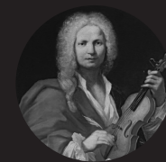
Antonio Vivaldi COMPOSER